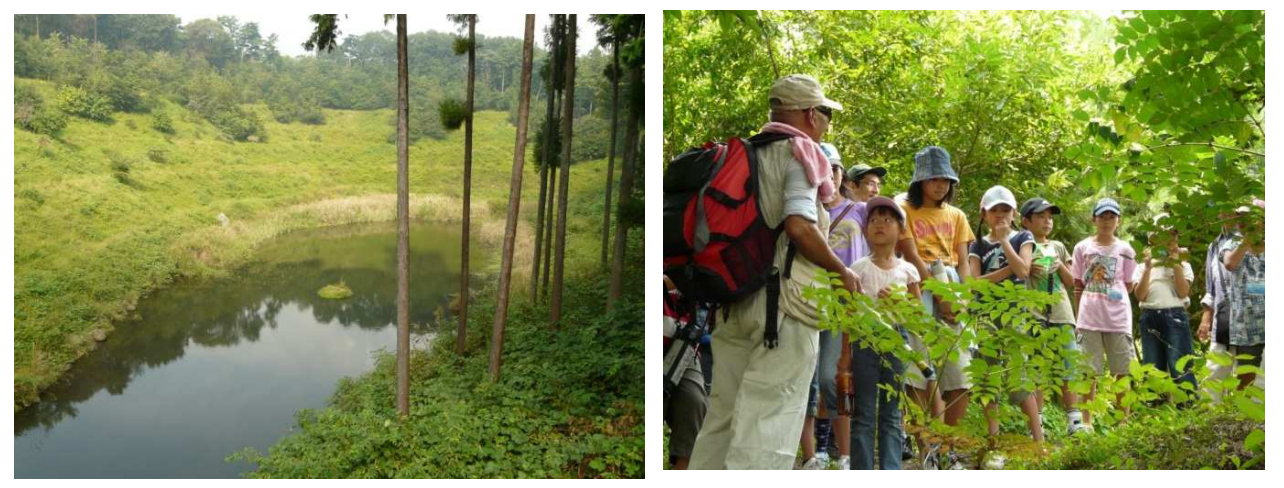
See whole articles here:

What is Sanden Forest : visit our Web-site <u>here</u>